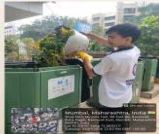
STEP 2: MIXING & LAYERING IN COMPOST BIN