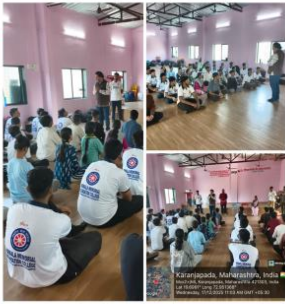
SESSION GUERRILLA WARFARE