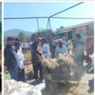
SURVEY ON MERI PANCHAYAT APP