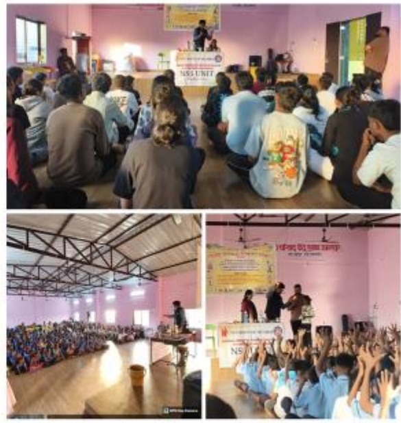
SESSION ON SUPERSTITION