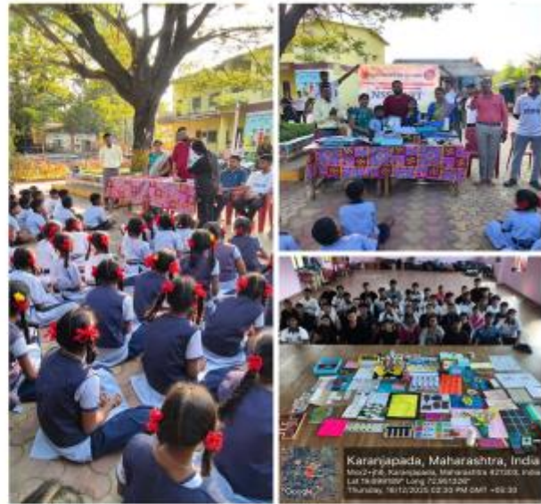
TOY & BOOK LIBRARY SETUP AT Z.P. SCHOOL