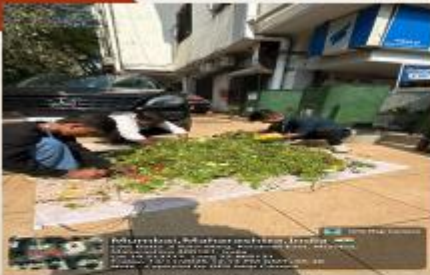
STEP 1: WET WASTE COLLECTION FROM VEGETABLE VENDORS