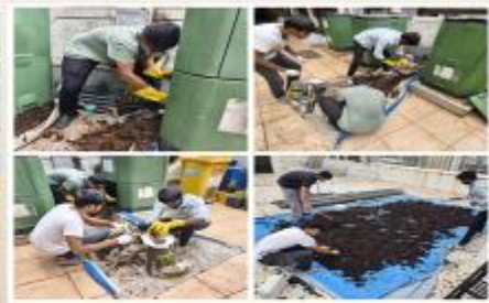
STEP 3: COMPOST PROCESSING