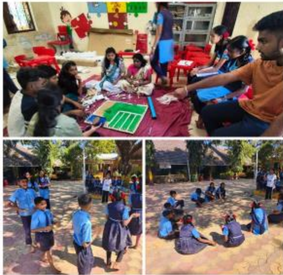
GUIDING SCHOOL CHILDRENS FOR PROJECT AND STREET PLAY