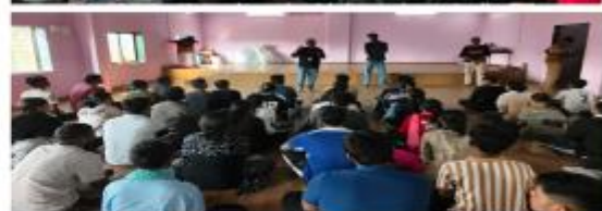
SESSION ON LEADERSHIP & PERSONALITY DEVELOPMENT